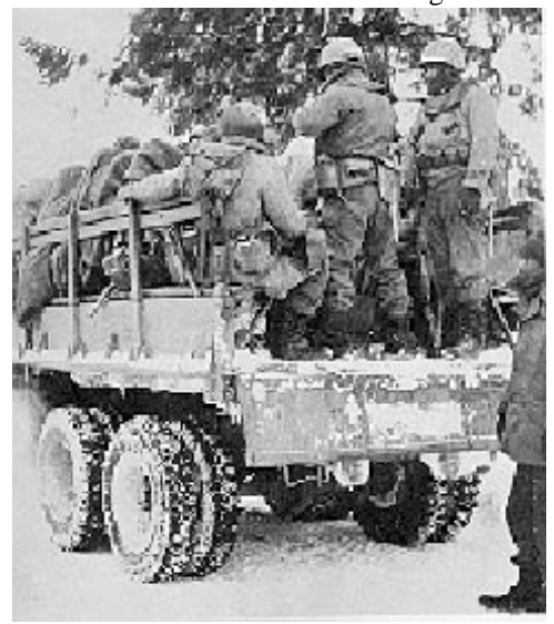
couple of other guys to get on a truck that didn't have no top. It was a cold and windy