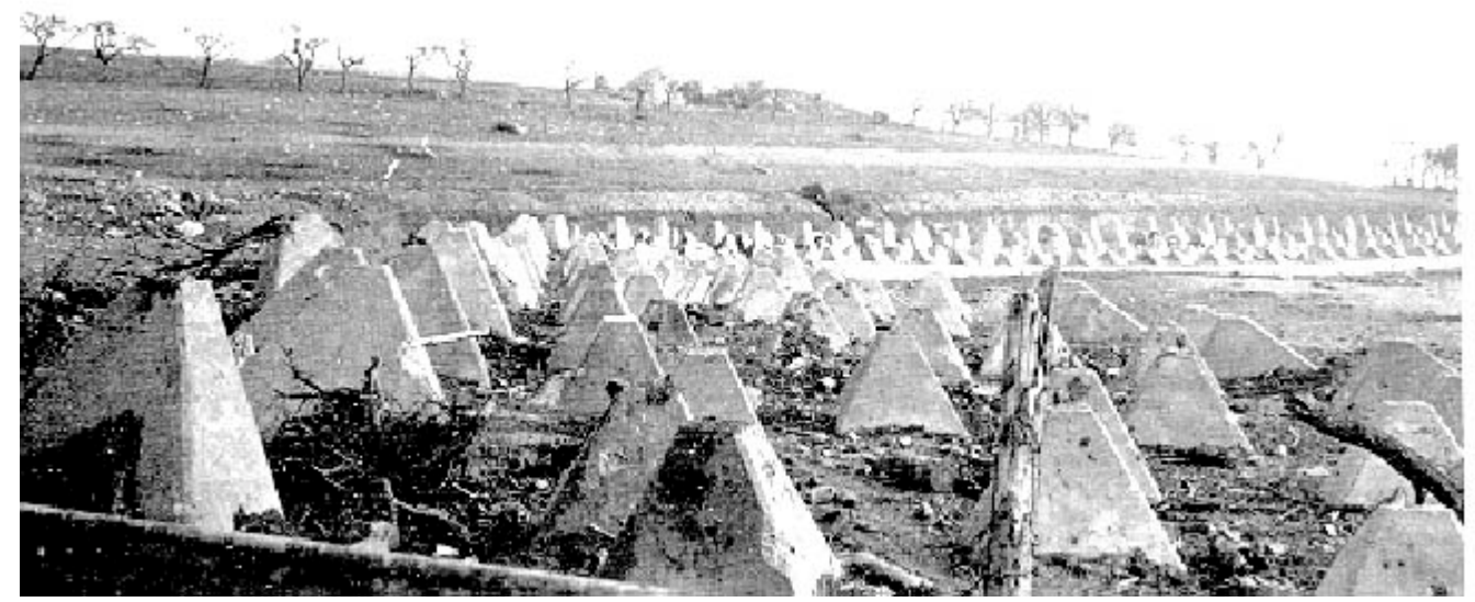
Dragon Teeth of the Siegfried Line - 1945