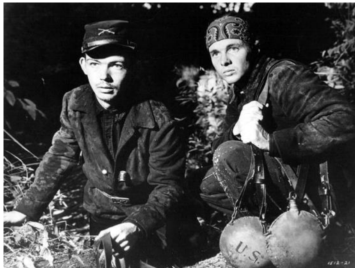
Movie still from the 1951 film, RED BADGE OF COURAGE.

accept, tolerate, temporize, and sometimes compromise. Not Murphy. In him we all recognize the straight, raw stuff, uncut and fiery as the day it left the still. Nobody wanted to be in his shoes, but nobody wanted to be unlike him either.