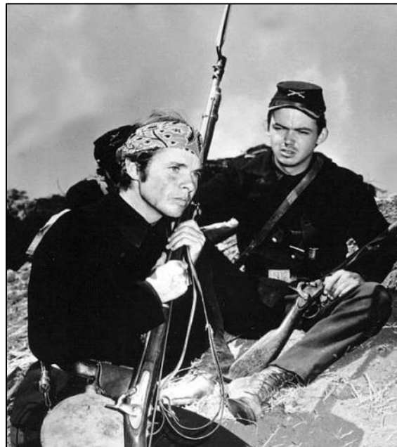
Audie Murphy as Henry Fleming and Bill Mauldin as Tom Wilson from the 1951 film, THE RED BADGE OF COURAGE .

could never pay our bills. I shared his terrible need to feel respected, upright and important. However, I was lucky. My furies weren't as burning as his and I was able to work most of them out on paper. Audie took the hard way, cutting a swath through the Wehrmacht and then trying to do the same in Hollywood. There