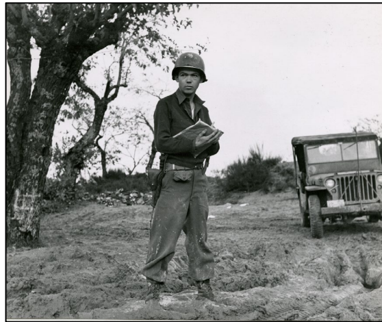
Army Technician 3 rd Grade Bill Mauldin, U.S. Army correspondent, during World War II.

"The Loud Soldier," that he had run from battle the day before. After many takes, Audie became more and more sullen.